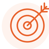
Tackling Hatred in Society